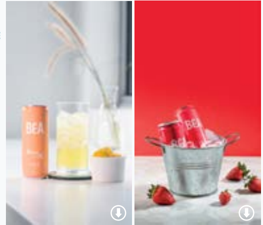
Story Feature on Instagram