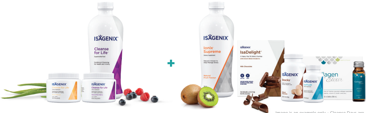
Image is an example only - Cleanse Days are customisable based on your preferences and goals.