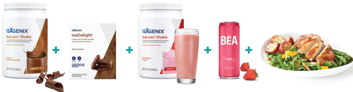
Image is an example only - Shake Days are customisable based on your preferences and goals.